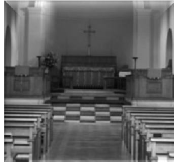
St Martin's Church